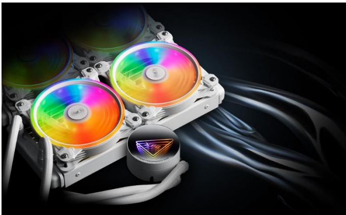
INFINITE MIRROR PUMP DESIGN

An All-In-One CPU Liquid Cooler with industry-leading engineering from Asetek, XPG LEVANTE X provides excellent CPU heat management. This reliable, high performance Liquid Cooling solution ensures smooth system operation for an optimal gameplay experience.