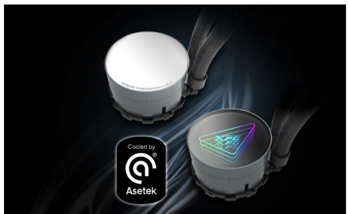
Asetek 7th Gen PATENTED CPU COOLING SOLUTION