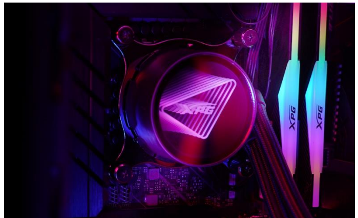
LATEST INTEL & AMD PLATFORM SUPPORT