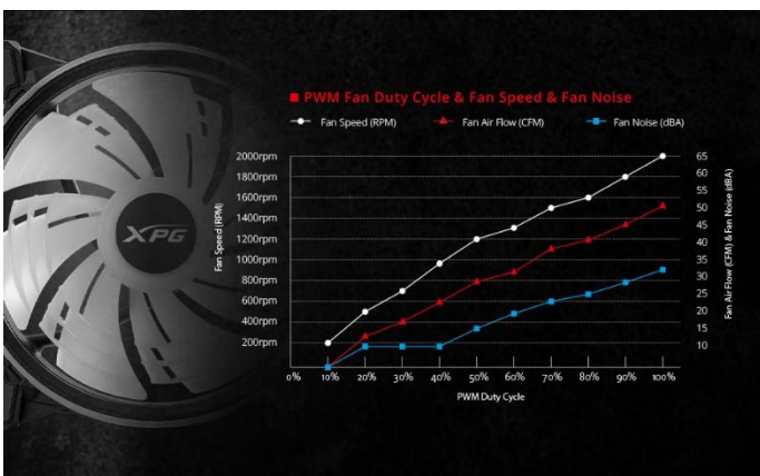
EFFICIENT PWM DESIGN