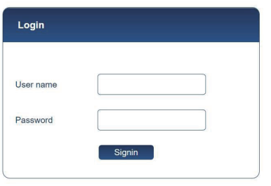
Figure 4. WebUI login