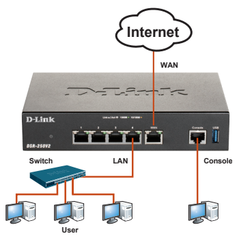
Figure 3. Basic Cabling Example