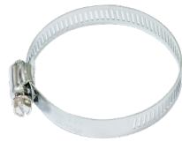
A hose clamp included

The mANT LTE is an omnidirectional antenna specifically designed for LTE frequencies. It is an excellent companion to our LTE devices, such as the wAP LTE and LtAP series. The antenna has a 5 dBi gain, improving your connection in the areas with inadequate LTE service coverage, allowing you to increase your connection speed.