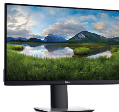
DELL 24 MONITOR | P2419H

Optimize your workspace with this efficient 24" monitor with an ultrathin border, a small footprint and comfort-enhancing features.