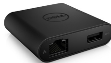
DELL ADAPTER | USB-C TO HDMI/VGA/ETHERNET/USB 3.0 | DA200

This lightweight and compact power bank will allow your laptop or cellphone to stay powered on-the-go without adding bulk to your bag.