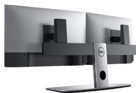
DELL DUAL MONITOR STAND | MDS19

Designed with a compact size and chiclet keys, this keyboard and mouse offers the convenience of wireless and clutter-free performance at your desk.