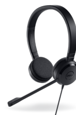
DELL PRO STEREO HEADSET | UC150

This space-saving stand, mounts up to two 27-inch monitors, providing the screen real estate you need to be most productive.