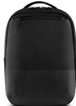
DELL PRO SLIM BACKPACK 15 | PO1520PS

Get everyday wireless performance with excellent battery life, no matter where you work.