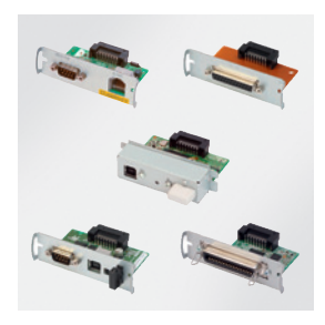
The TM-T88V is obtainable with a variety of interchangeable interfaces.