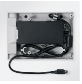
The optional power pack case saves space by fitting under the TM-T88V.

The optional wall mounting is ideal for hanging up the TM-T88V, in the kitchen section for example.