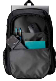
HP Prelude Pro Recycled Backpack