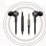
Lenovo 500 Extra Bass In-Ear Headphone