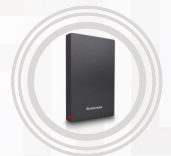
Lenovo UHD F309 1TB Portable Secure Hard Drive