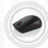
Lenovo 300 Wireless Compact Mouse