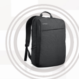
Lenovo Casual Backpack B20